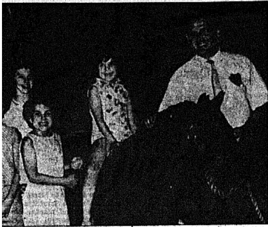
Given away at mer- Collegiates is the Pulaski. Mr. and ith their four chil- t), president of the

local club. The Collegiates played before the largest crowd of the season, 653 fans, and came through with a 13-4 win over Peoria Thursday night at Galen Shirley Field.