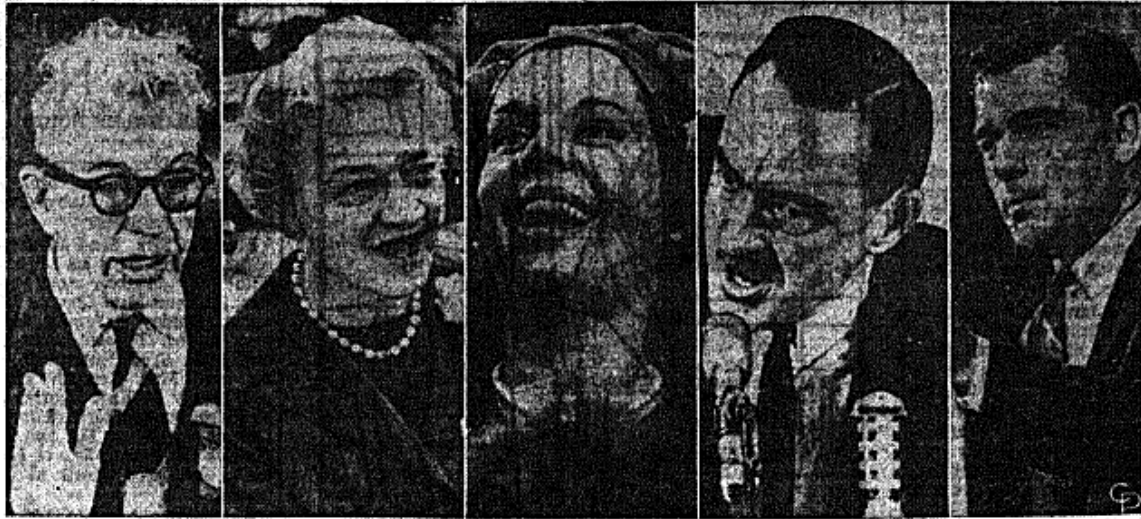
CONVENTIONAL FOLK—Among the prominent faces at the GOP National Convention in San Francisco are (from left) Sen. Everett Dirksen, Ill.; Sen. Margaret Chase Smith, Maine; Mrs.