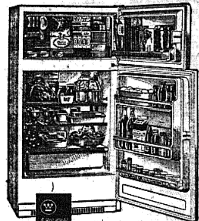
Model RJE 31

Frost-Free—Cold Injector Cooling keeps food fresh longer.