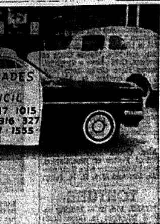
Persons, including some from neighboring Marchers, automobiles and trucks were Trades and Labor Council.