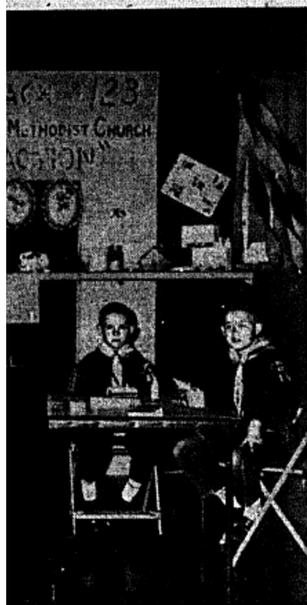
den mother, is shown with Cubs of the den demonstrating their prowess in handiwork.