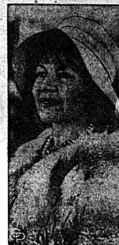
RITA'S BACK — Bedecked in furs and beads, actress Rita Hayworth steps off the liner United States in New York.