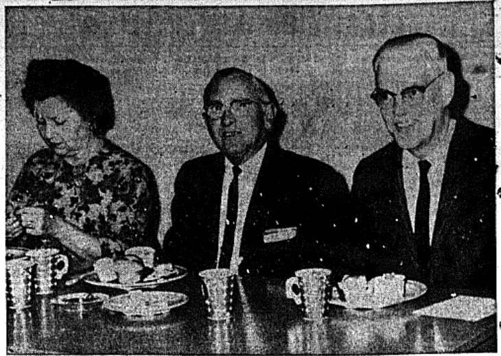
HAM, SAUSAGE, EGGS are enjoyed by above at the annual farm products meal served Saturday at the high school in Lincoln. From

The Senate has nothing important scheduled for the floor and may be in recess several days this week.