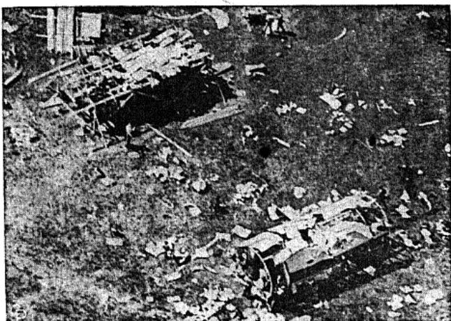
PUTTING THE JET BACK TOGETHER—Federal and Boeing representatives are on the job of re-assembling wreckage of the Northwest Orient jetliner in the Florida Everglades. That's the recent crash that killed 45 persons, all on board. At lower right is the middle section.

Her parents, two sisters and one grandson preceded her in death. She was a member of the Methodist church.