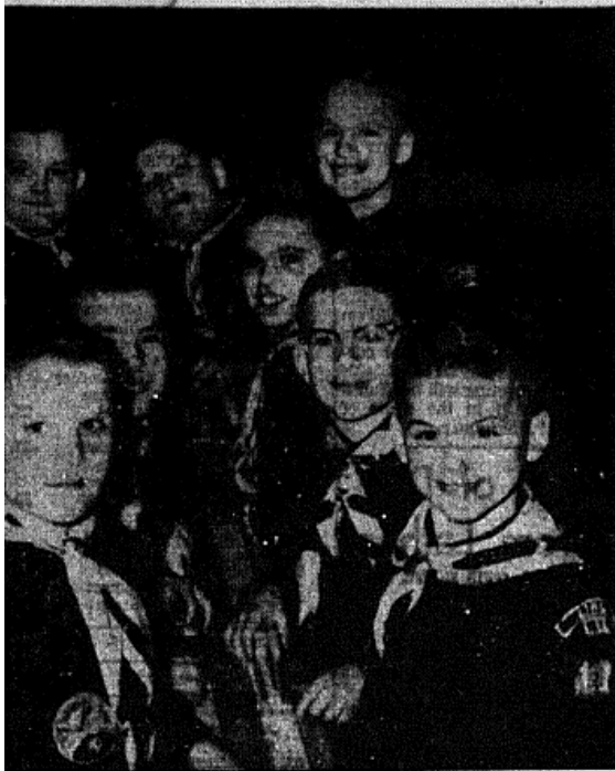
us Lincoln pack 118 anguet at the school of the evening was cars the boys and as called the "Pine-