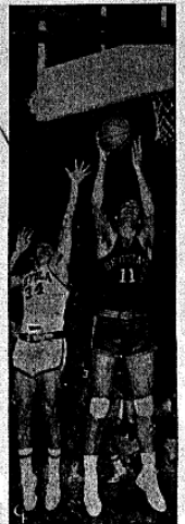
EASY FOR ACH — Ohio No. 1 star, Jerry Lucas, shows you how easy it is to score during game with Loyola in Chicago. Ohio State is the nation's No. 1-ranked team, and still undefeated.