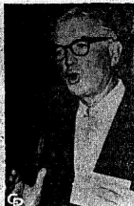
SEN. STUART SYMINGTON