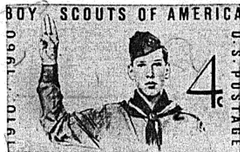
BE PREPARED to signalize the 50th anniversary of the found- ing of the Boy Scouts of America with this 4-center, which goes on sale Feb. 8. Khaki and blue are the colors. The stamp was designed by Norman Rockwell.