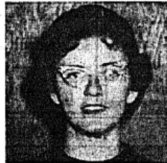
1st PRIZE WINNER