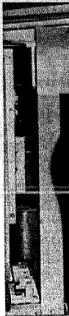
PLANT VISITORS—Co., explains the plant on dinnerware during plant for Mayor R