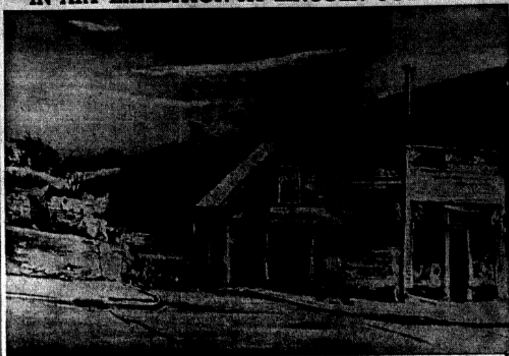
"STREET IN JOLIET," by Aaron Bohrod of Chicago, is one of the art pieces to be exhibited at Lincoln College Dec. 14 through Jan. 11, 1937,

In the "Water Colors of the United States" series. The exhibition is open to the public.