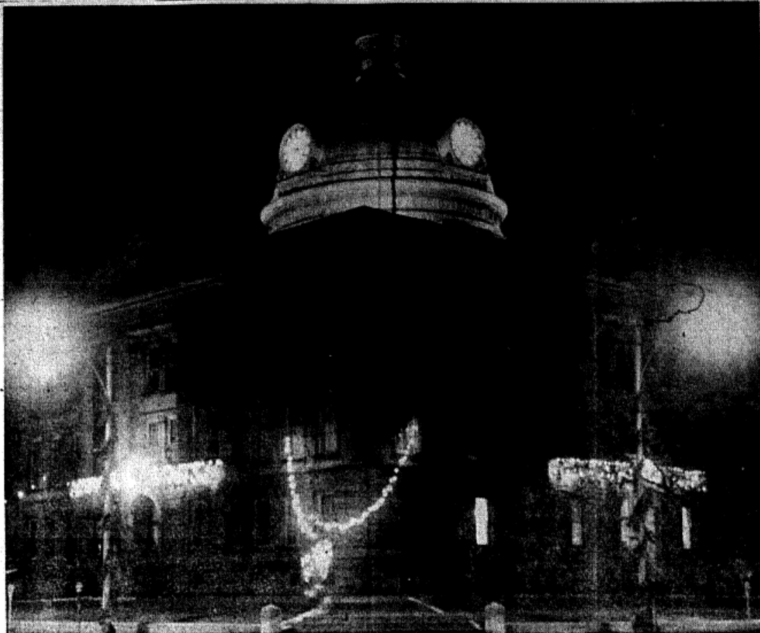
A BEACON FOR SANTA—The Christmas decorations on the courthouse here serve a double purpose. They help demonstrate Lincoln's Christmas spirit and serve as a beacon for Santa

ere e treated as crippled sam Lin- il. Mrs. th nurse, six new e X-rays